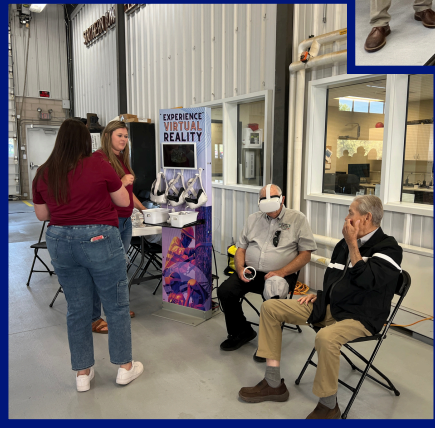
Virtual Reality Station