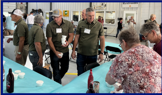
Board of Directors Serving Ice Cream